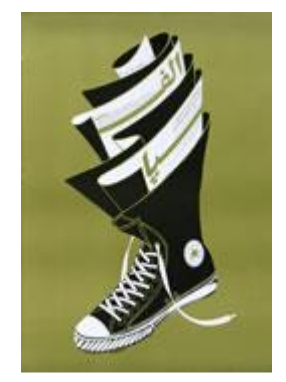
MAHDI FATEHI [Iran] Alefpa-The Poster Exhibition of Students' Experiences