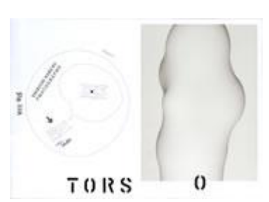
HIROAKI NAGAI [Japan] Shinichi Kaneko Photo Exhibition "TORSO"