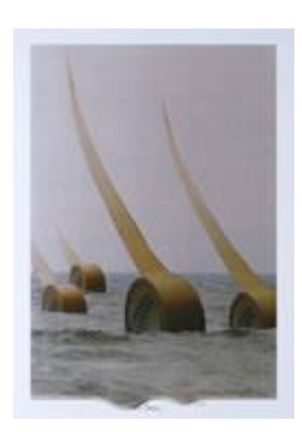
KOZUE TAKECHI [Japan] At Sea