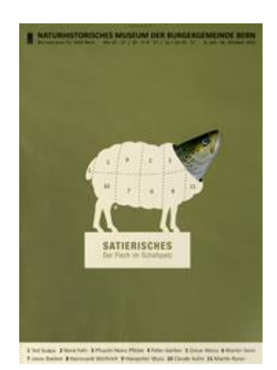
CLAUDE KUHN [Switzerland] SATIERISCHES / DER FISCH IM SCHAFSPELZ EXHIBITION