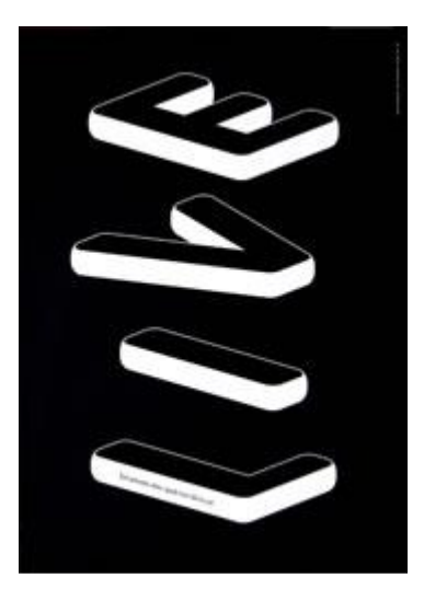
RALPH SCHRAIVOGEL [Switzerland / The Netherlands] EVIL LIVE - Evil prevails when good men fail to act