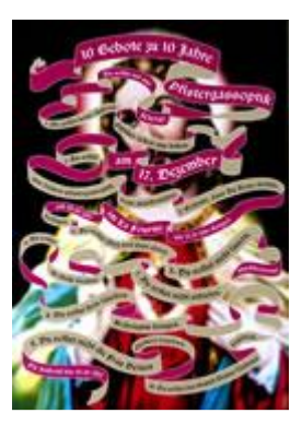
MATTHIAS HOFMANN [Switzerland] 10 COMMANDMENTS