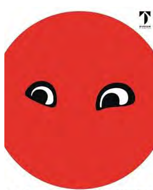
日本の美 美術×デザイン [8月 2019年8月10日(土) - 10月20日(日)] Beauty of Japanese Art and Design From Rimpa and Ukiyo-e to Present Art August. 10th - October. 20th, 2019