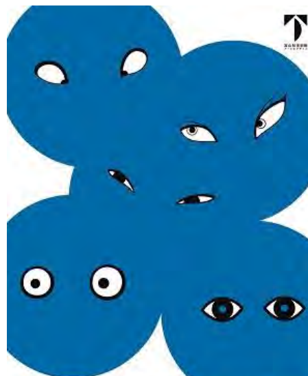
日本の美 美術×デザイン [展覧・浮世絵版画から現代へ] 2019年8月10日(土)~10月20日(日) 富山県美術館 3-20 Kiba-machi, Toyama City, Toyama, 930-0806 Beauty of Japanese Art and Design From Rimpa and Ukiyo-e to Present Art August.10th - October.20th, 2019 Toyama Prefectural Museum of Art and Design, 3-20 Kiba-machi, Toyama City, Toyama, 930-0806

One of the major features of Japanese Art is its decorativeness. The flow of Rimpa uses the abundance of nature as its motif, and the "decorative beauty" of gleamy gold and silver as well as the refined designs have been loved by people, crossing the border of painting and craftsmanship. The Ukiyo-e, too, has fascinated people since the Edo period. It skillfully employs expressions from all times and places. These expressions, abundant with a feeling for design that includes bold constructions and color schemes, did not fail to enchant the European Impressionists of the 19th century and enjoy a high degree of esteem even more so nowadays. Since the Meiji period, it has become common to distinguish between "art" and "design." Nevertheless, the decorativeness of Japanese Art has penetrated all kinds of genres and has been passed on to many contemporary artists and designers. This exhibition focuses on the decorativeness and designs that can be found in Japanese Art and presents its versatile beauty starting with Rimpa and Ukiyo-e, also displaying contemporary paintings and even posters.