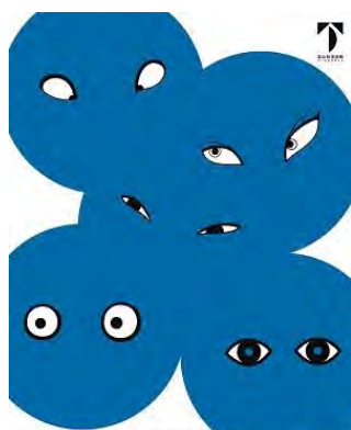
日本の美 美術×デザイン [8月 2019年8月10日(土) - 10月20日(日)] Beauty of Japanese Art and Design From Rimpa and Ukiyo-e to Present Art August. 10th - October. 20th, 2019